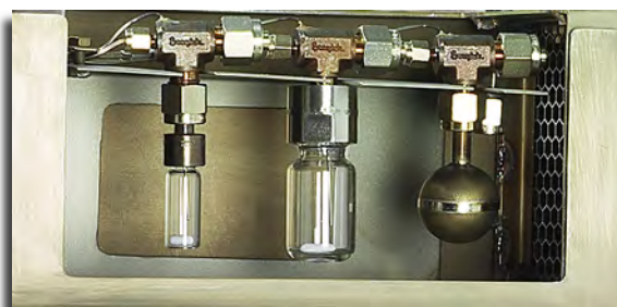
Sample containers: Glass 'HPLC' vial, Glass 10ml vial, Spherical ARC 'bomb' Ti, Hastelloy-C, SS-316