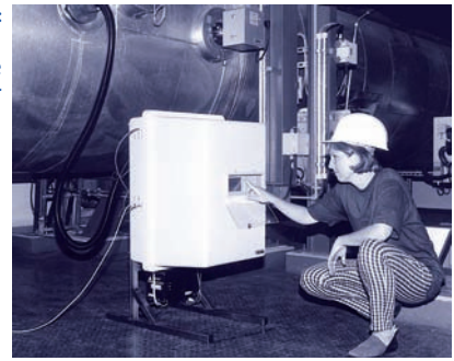
SM-3: Installation at a municipal waste incinerator

The SM-3 Mercury Stack Gas Monitor is used for continuous monitoring of mercury in stack gas. Bound forms of mercury like \text{HgCl}_2 , \text{HgO} , \text{HgS} and particulate mercury are detected as well as elemental mercury.